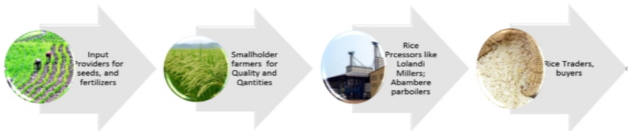
Figure 2: Illustration of rice value chain actors

opportunities. The Rice Initiative had over 6,000 direct beneficiaries, who were supported to access inputs, parboiling vessels and extension services. Crucially, this also meant that the programme forged strong partnerships with private sector actors in the value chain including providers of agricultural inputs, tractors and finance, and millers. One example was the agreement of a service contract with rice miller Lolandi. One example was the agreement of a service contract with rice miller Lolandi.