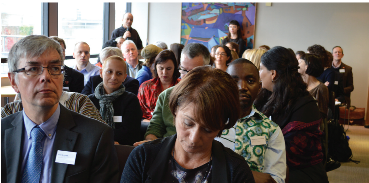
Over 120 participants, from Ireland and overseas, took part in the international peer learning conference, “Civil Society, Conflict Transformation and Peace Building” in Belfast (November 2014). The conference was organised by Christian Aid Ireland, with the Transitional Justice Institute, Ulster University

(Oxfam GB (2011) ‘Within and Without the State: Strengthening Civil Society in Conflict-Affected and Fragile Countries: a summary of current thinking and implications for practice’, p. 12: http://policy-practice.oxfam.org.uk/publications/within-and-without-the-state-strengthening-civil-society-in-conflict-affected-a-209789 )